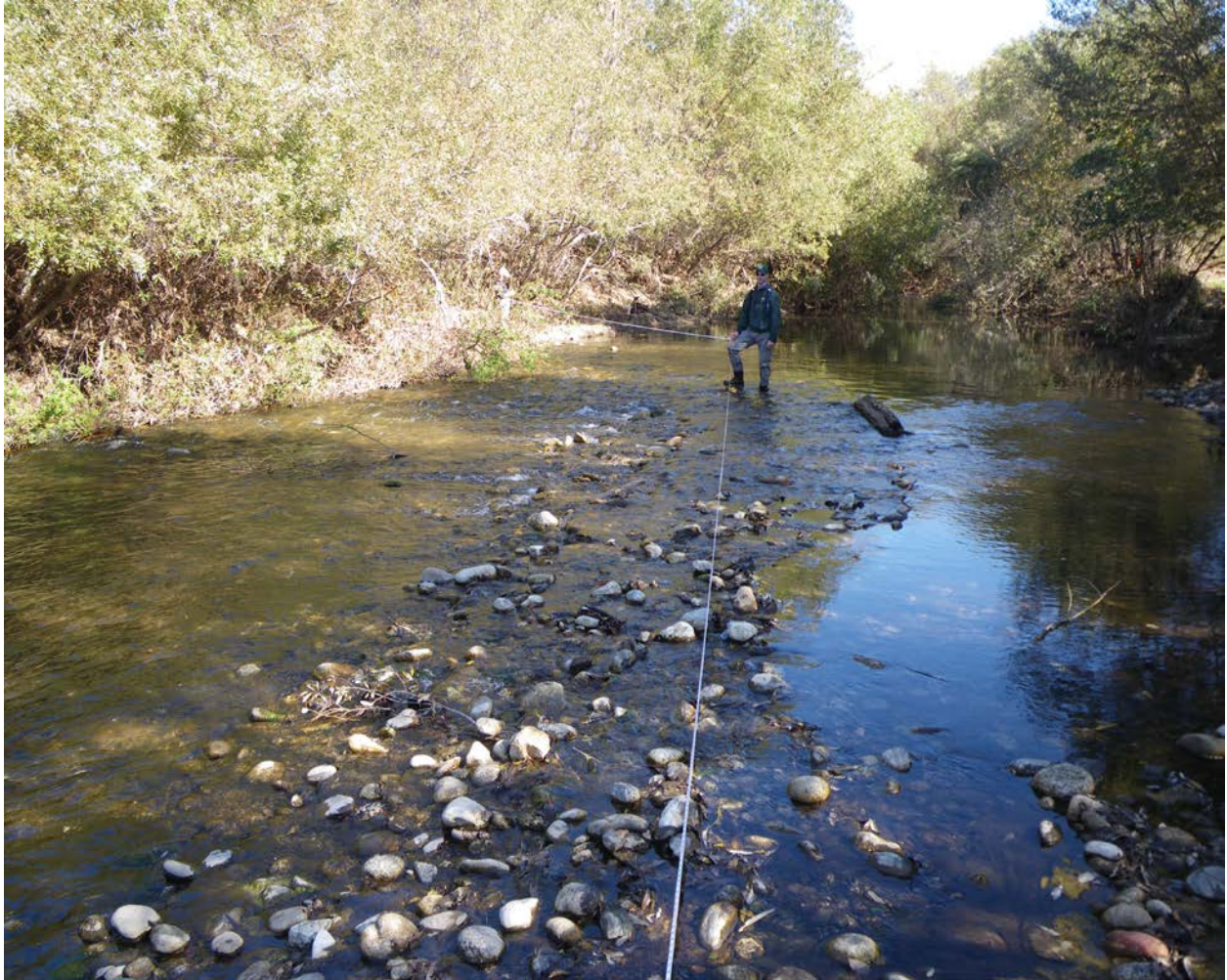
Figure 1. Example of a critical riffle transect that follows the shallowest course from bank to bank.

Step 4: Determine the interval size at which to measure depth along the transect by considering the total transect width. Depth should be measured at a minimum of 20 evenly spaced intervals along the transect. A minimum sampling interval of 1 ft is recommended for CRA sites with critical riffles of greater than 20 ft from bank to bank. The sampling interval for CRA sites that are less than 20 feet from bank to bank should be adjusted so as to meet the 20 minimum depth measurements. Consultation with ODFW staff indicate more robust depth to flow relationships being achieved with approximately 50 depth measurements on the critical riffle (Tim Hardin, personal communication, July 2, 2012).