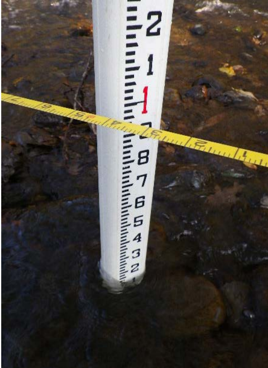
Figure 3. Detail: Using the stadia rod to measure depth along a critical riffle transect.