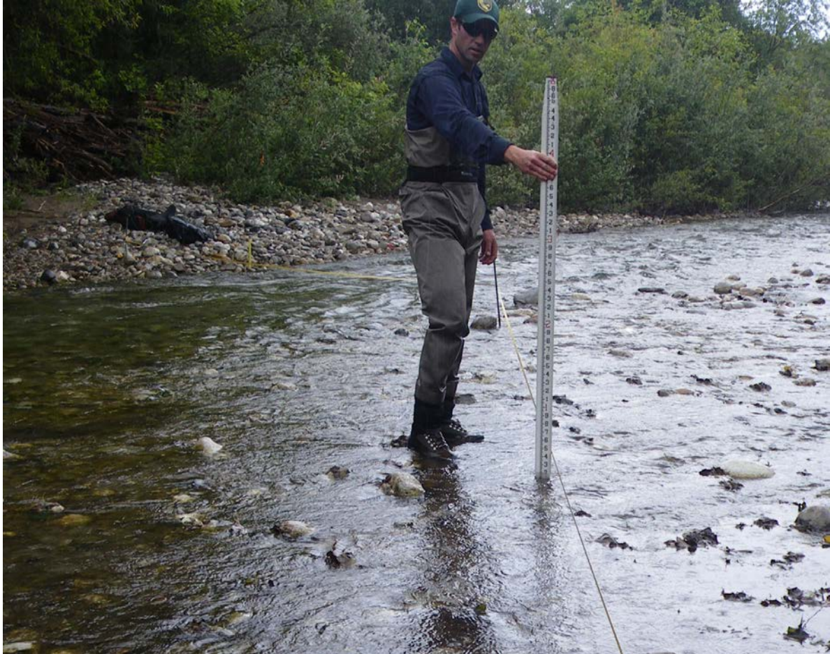
Figure 2. Example using stadia rod to measure depth along a critical riffle transect.